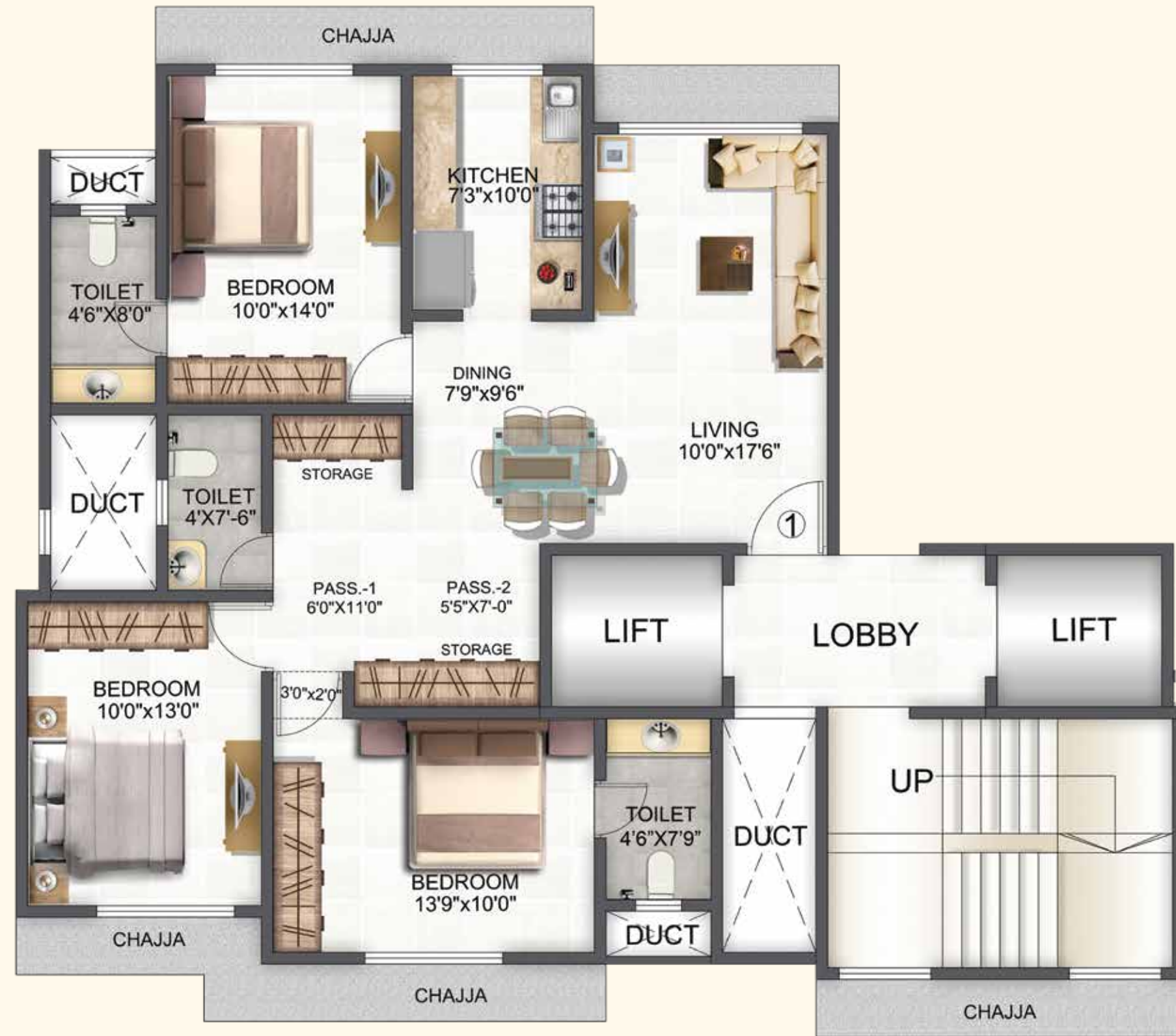
WING B - FLAT NO. 01 (3 BHK - RERA 989 SQ.FT.)